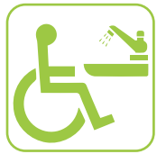
High Wash Basin