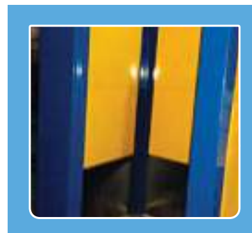
Steel Structural Erection